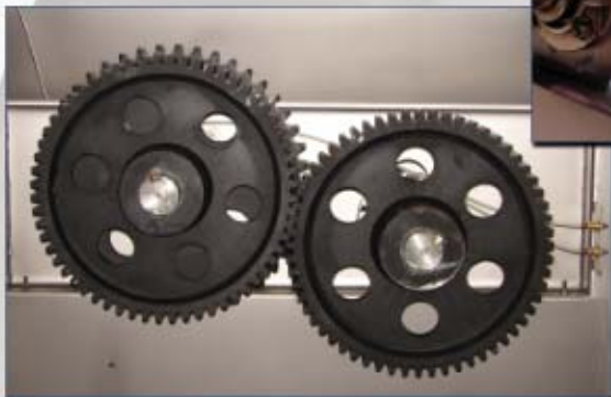
Heavy duty spur gear driven agitators.