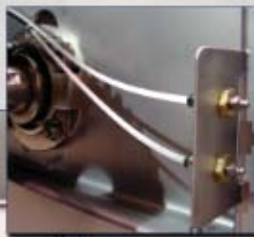
Easy to grease bearings.