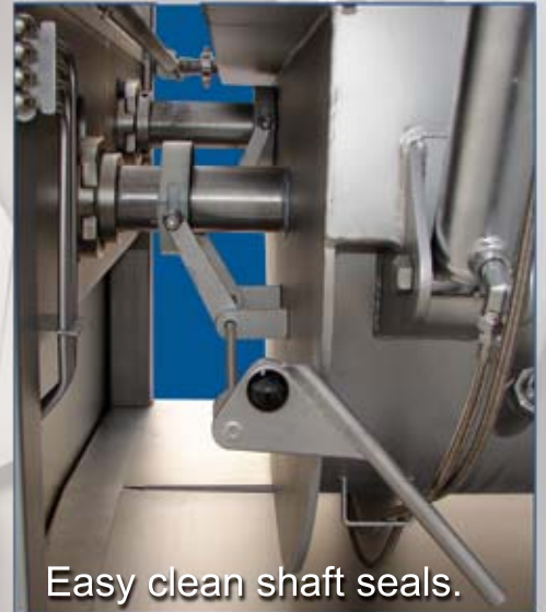
Easy clean shaft seals.