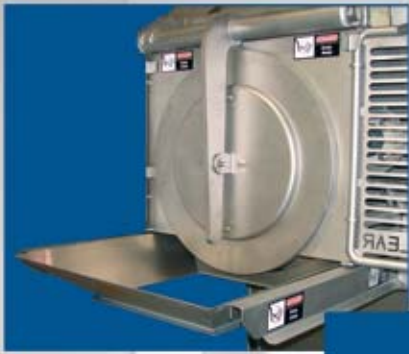
Oversized discharge door.